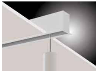
MTRFG 1.5" Recessed Flanged Modular Track