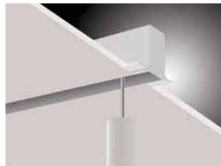
MTRTS 1.5" Recessed Trimless Modular Track