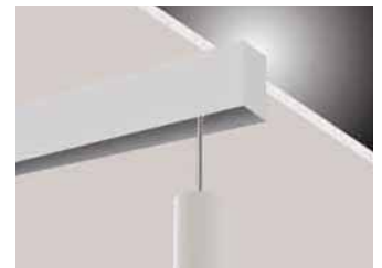
MTSRF 1.5" Surface Modular Track