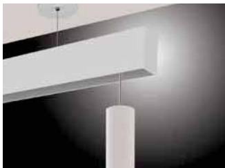
MTPDN 1.5" Pendant Modular Track